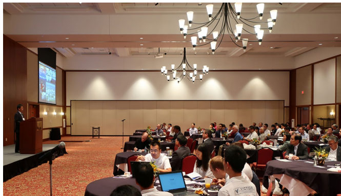
Last symposium: FAST-zero '19

FAST-zero'21 will be held in Kanazawa, a historical place of Japan after the successful 5th symposium in Blacksburg, Virginia. Following the tradition of FAST-zero symposia, we will bring together researchers and engineers from industry and academia to present the current state-of-the art and progress in research and development of active safety technologies.